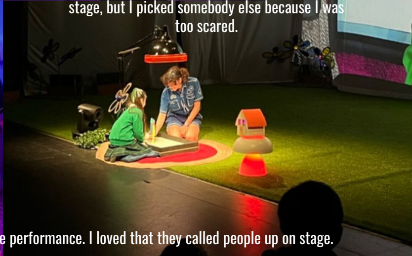
Anastasia 1D – I loved going on the train and watching the performance. I loved that they called people up on stage.