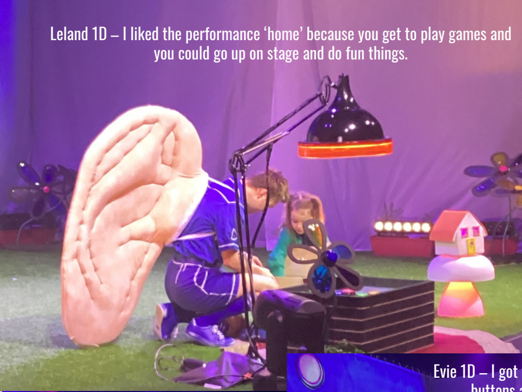
Leland 1D – I liked the performance ‘home’ because you get to play games and you could go up on stage and do fun things.