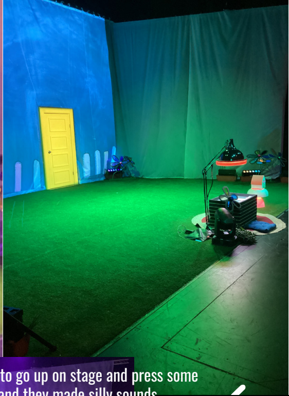
Evie 1D – I got to go up on stage and press some buttons and they made silly sounds.